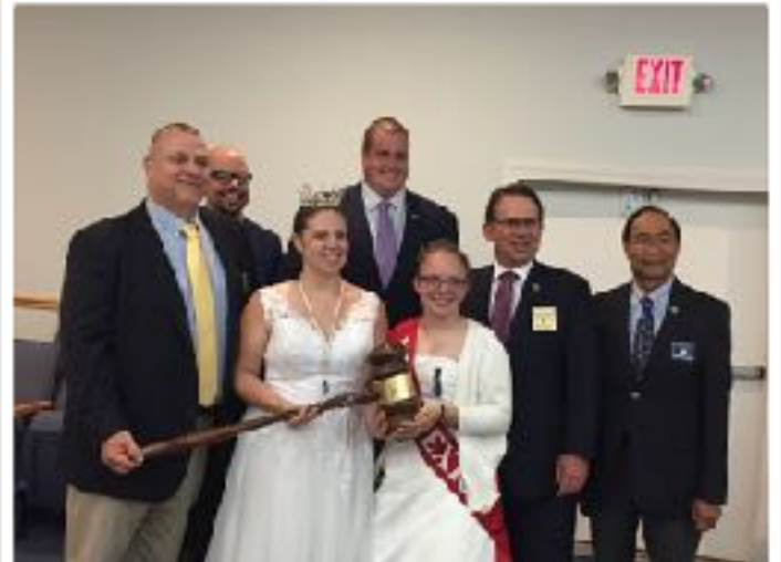
District 15 Masons with the Trenton Assembly #9 Rainbow girls